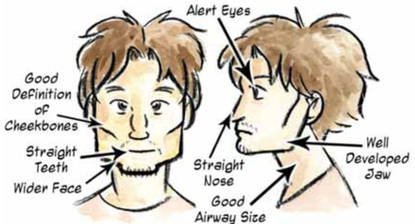
Fig. 1: The facial characteristics of a nasal breather. Based on Irish International and LA Galaxy soccer captain Robbie Keane.