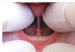
between midline and apex (2)